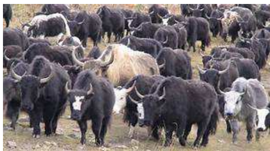
Yaks hold first Old Timers day. Presenting the All-Time Yaks team.

conditioned fully enclosed stadium is well underway and is expected to be completed in time for spring training beginning in February 2021. Angel management has committed to build a more balanced pitcher friendly park than Halo park which favors left handed hitters with its shallow 350 ft low walls in right and center field. The outfield walls in the new park will be eventually be 400' all around the field from LF foul pole to the RF foul pole. However, in 2021 there will be a temporary wall in the OF behind which will be the bullpens for both teams 375" from home plate. Permanent bullpens will be built in the off season adjacent to the dugouts of each team, and the temporary wall will be removed for the 2022 season. Because of the dome, we will be playing in a temperature controlled environment and weather effects will no longer be an issue. We are currently working on a name for the ballpark, and the team name will be changed as well. So there is a lot going on within the Angels franchise. We have several players who are playing well this year and lots of draft picks to help form a new identity for our new Southern Franchise. Future updates will be provided as progress is made.