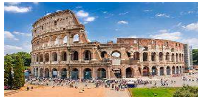
of War Memorial Coliseum when it first opened