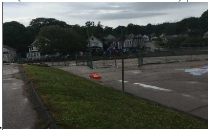
The iconic School Yard.

(We played hardball down where they now have the playground stuff. The four trees that were on the field have long been cut down. The present grass area was blacktop in my day. When it snowed we would slide down the slope standing up. The teachers would even let us pour water down the slope to make it icy. No way would it be allowed today. Damn insurance companies and lawyers. No offense to my insurance and lawyer FBN friends.)