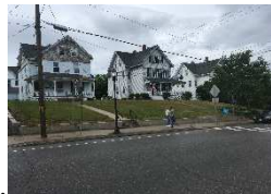
Training Camp at 115 Broad St. (the house with the flag).