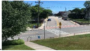
The view from Training Camp at 115 West Broad St.