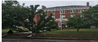
West Broad Street School (home of the School Yard).