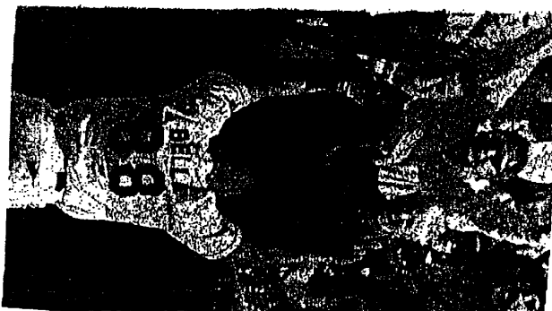
Cal's Belle and retroic Dreamer fans: take for each other