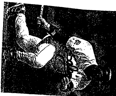
Big Ed with 19 ribbles